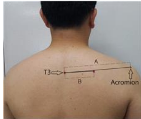
Figure 2. Scapular size was measured by the distance difference value between (A) from the 3rd thoracic spinous process to posterolateral acromion and (B) from the 3rd thoracic spinous process to root of the scapular spine. Normalized scapular abduction distance=[scapular size+(B)]/scapular size.

Liberty was used for collecting three-dimensional displacement data; however, the tape measure was two-dimensional. The tape measure was used to measure scapular abduction and protraction although scapular movement might result not only to abduction and protraction but also to other movements. Thus, Liberty was used to measure overall scapular movement, namely the three-dimensional displacement of the scapula.